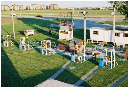
Spring 5-stand League

The fall 5-stand league ended with some nasty weather. So we held off for the Spring to resume. Those who shot the fall league will be grand