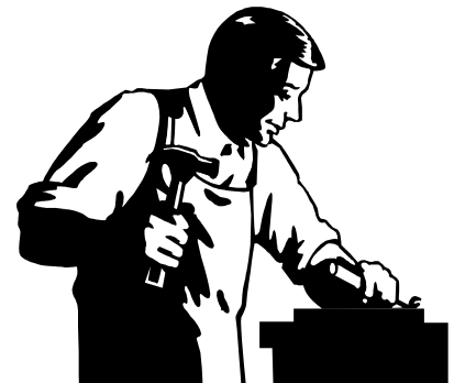
Working hard for your club

When it comes time to renew your membership for the Second year mention your work and you will be given a membership credit.