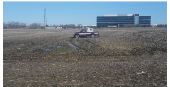
New Location of Green # 3

Who knows maybe this can be the future location for the new Long bird location.