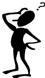
Not sure what to shoot?

Some of the different clay presentations we offer are: