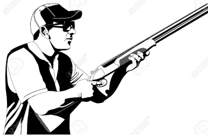
Trap League to start May 2nd

More rules, and info regarding how the league payout's are calculated and other info will be released in future issues of broken clays.