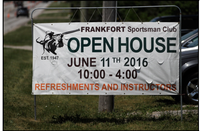
Proudly Displaying our sign on 191st