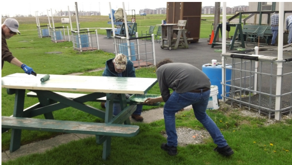
Tables get a nice fresh coat of paint