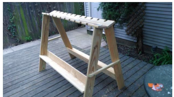
New Club Gun Rack