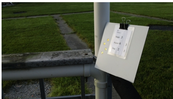
New course sheets

Another thing that you may have notice is there is no longer number 1 through 6 green and red on the target throwing machines.