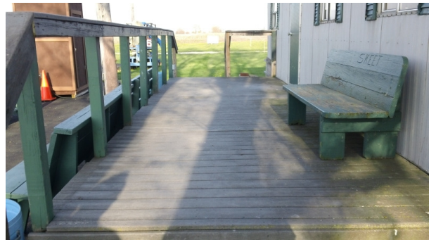
Tables get a nice fresh coat of paint

We would like to thank the following members for all their hard work on the April 23 and May 7th work party's: