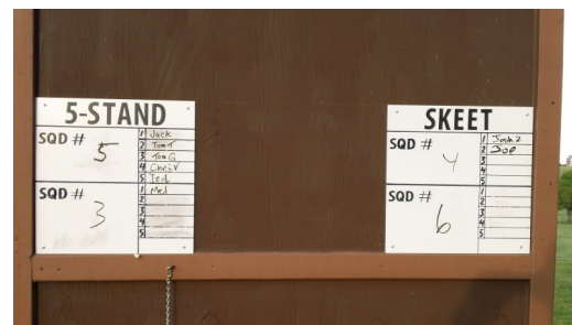
New Sign up sheets at the 5-stand / skeet area

Example Shooting on 5-stand squad # 3 you would be able to sign