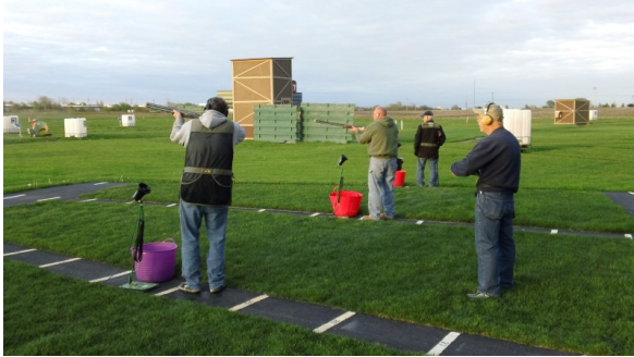
Trap league shooting on the 24 yard line.

So far the weather this spring has cooperated. It's mostly been sunny every Monday night.