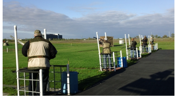
5-Stand Shooters Enjoying a nice spring league evening shoot.

View current League standings for both Trap and 5-standings on Page #8-9