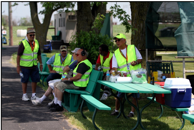
Thanks for the cooks for keeping us fed.