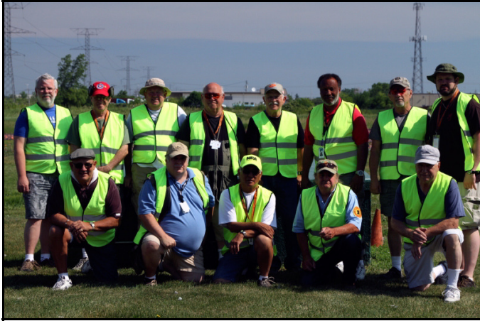
Thanks to all the members who helped out at the Open house