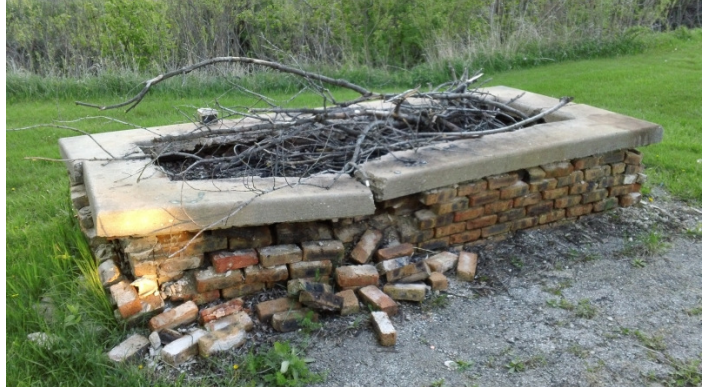
Crumbling pit has seen better days

Since this was built by one of our longest active members, our preference would be to preserve it rather than remove it.