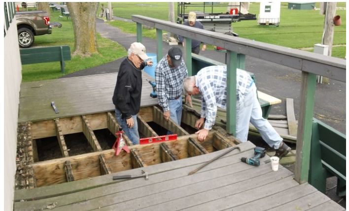
Fixing the 5-stand / skeet clubhouse deck

We wanted the club looking pretty good for our open house.